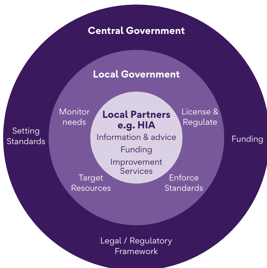
Figure 1: The framework for housing improvement

Central government has provided a legal and financial framework for housing improvement. Local government and NHS partners have delivered housing improvements, guided by this framework and working in partnership with other local organisations, such as Home Improvement Agencies (HIAs).